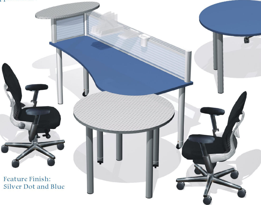
Feature Finish: Silver Dot and Blue